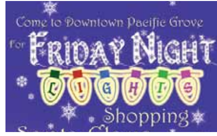
Friday Night Lights Meets First Friday - Page 9