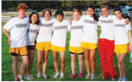
Cross Country - Page 5

Send your items to: kioskcedarstreettimes @gmail.com