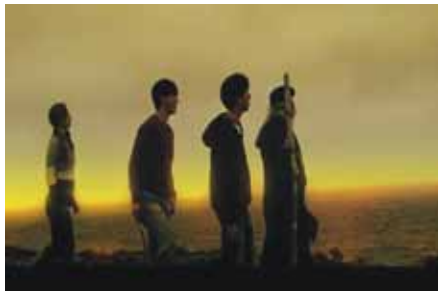
Potter movie - Page 5