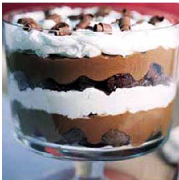
Chocolate Trifle: Brownie mix makes it easy, chocolate makes it wonderful.