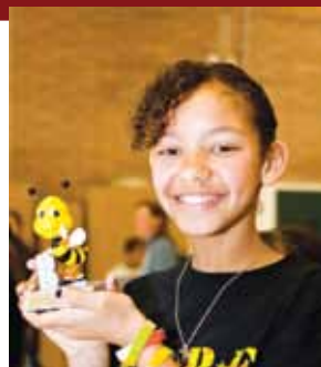
Speller - Page 9