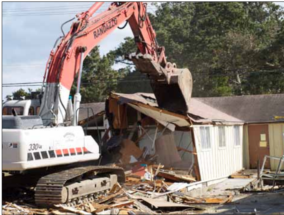
Classes had been held in Room 37 since 1948. Below, students watched the demolition on Feb. 16, 2011.

As the machine did its work, students stood by quietly; punctuat-